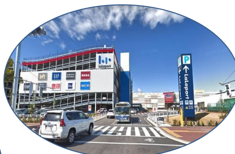
LaLaPort Nagoya (mall)