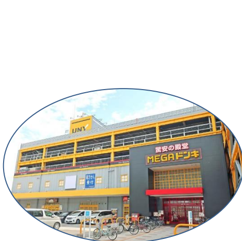
Mega Don Quijote