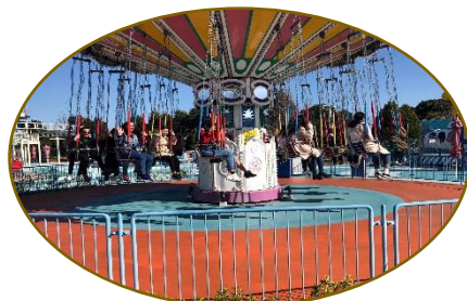
Graduation trip to Laguna Ten Bosch