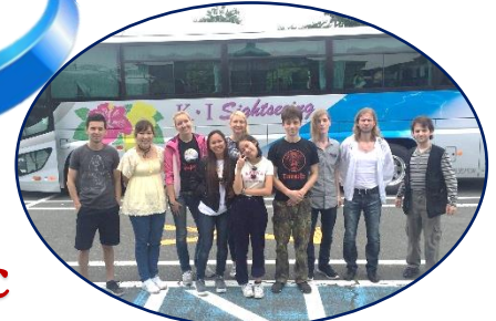
Visit to Mt. Fuji

First semester test Life guidance Higher education briefing session