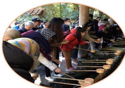
Atsuta Jingu Shrine "Hatsumode"

Study abroad in Japan exam Culture festival