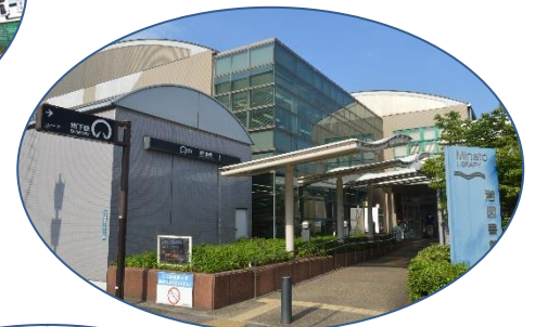
Minato War Library