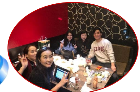
End of the year party

Japanese language proficiency test Year-end party Winter vacation