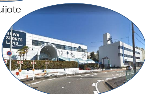
Howa Sports land